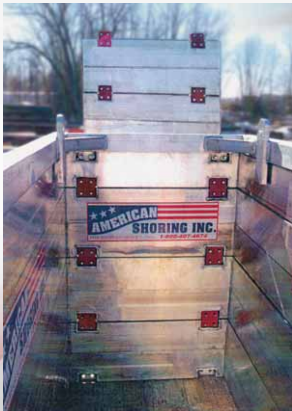
STACKING SECTIONS FOR REQUIRED DEPTH. TOP PROTECTION UNIT SHOWN ABOVE.