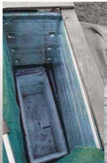
BUILT TO ACCOMMODATE ANY VAULT SIZE