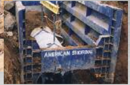
12 FT. HIGH AND 30 FT. LONG