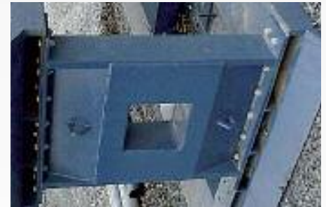
TAPERED FRONT TO REAR. FACILITATES DRAGGING FORWARD