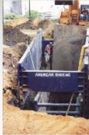
"BOX IN A BOX" METHOD OF CONTAINMENT CONTACT FACTORY FOR DETAILS