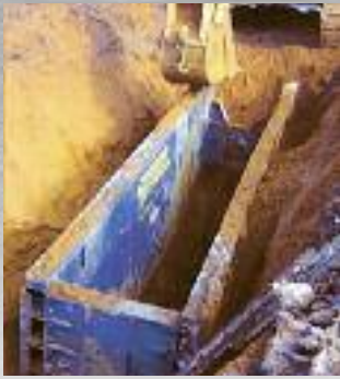
THE 8GLX1025 UNIT SHOWN HERE IS 10' HIGH X 25' LONG