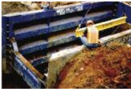
THE 10GLX1225 UNIT SHOWN HERE IS 12' HIGH X 25' LONG AND MADE OF HIGH ALLOY STEEL