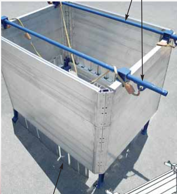
SHEETING EXTENDS BELOW THE UNIT