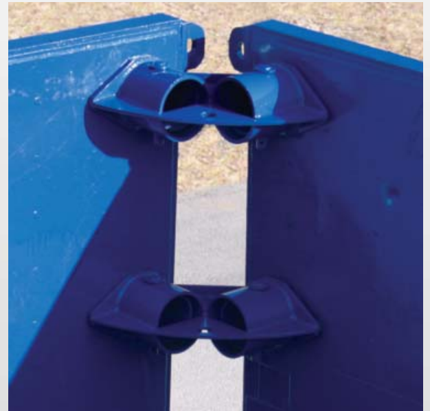
(8) Corner Brackets make it easy to transform to a four sided trench box