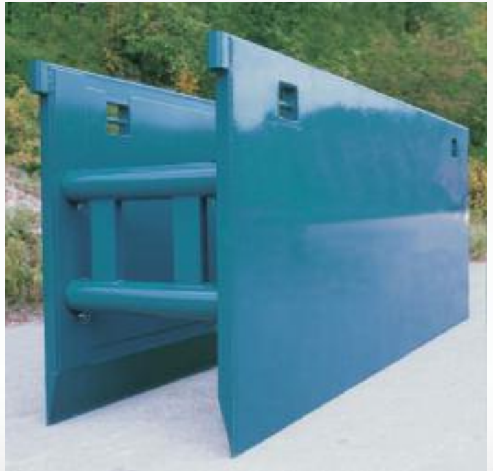
DW MODEL IS THE SAME AS THE "SW" EXCEPT WITH THE ADDITION OF A FULL INTERIOR PLATE