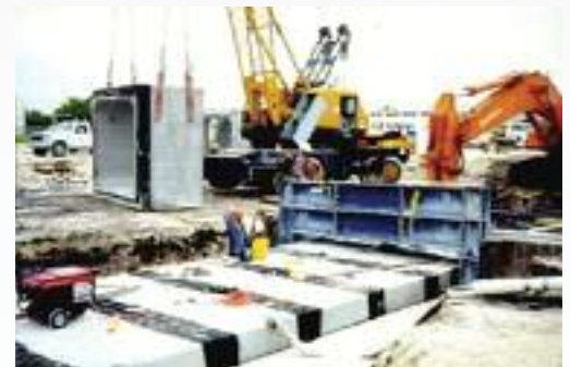
BOX CULVERT INSTALLATION WITH 18' HIGH X 18' WIDE CLEARANCES