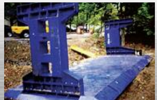
HEAVY DUTY BOLTED SPREADERS FEATURE "WINDOWS" FOR BETTER OPERATOR VIEWING. ADDITIONAL SPACERS CAN BE ADDED FOR WIDTH CHANGES