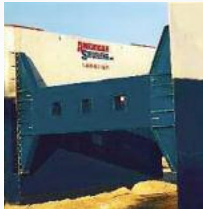
16' HIGH HEAVY DUTY BOLTED TRENCH BOX